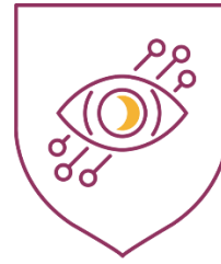
Student Agency and Innovation