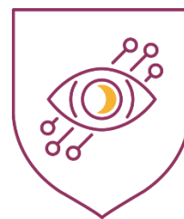
Student Agency and Innovation