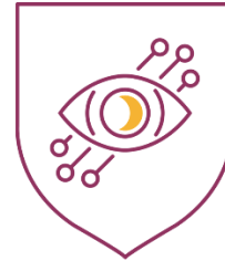
Student Agency and Innovation