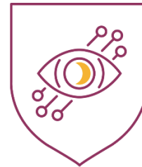
Student Agency and Innovation