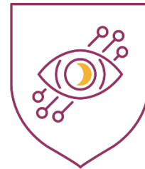
Student Agency and Innovation