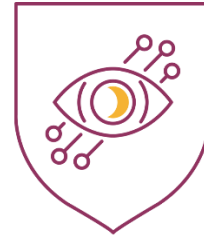
Student Agency and Innovation