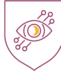
Student Agency and Innovation