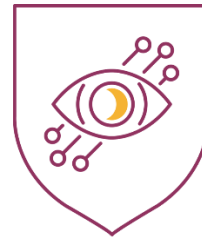
Student Agency and Innovation