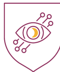
Student Agency and Innovation