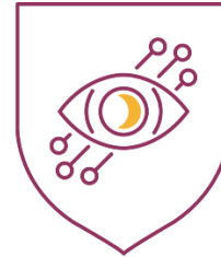
Student Agency and Innovation