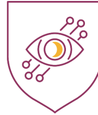
Student Agency and Innovation