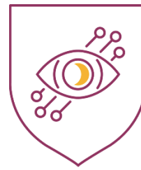
Student Agency and Innovation

GEMS Wellington Academy, Al Khail, is committed to encouraging and developing positive attitudes towards food and a healthy diet. We recognise the importance of offering children the opportunity to make informed choices about what they eat.