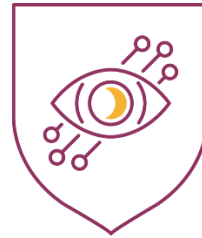
Student Agency and Innovation